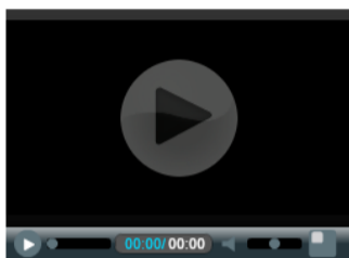
Chip Foose And The New 3M™ Body Protection System